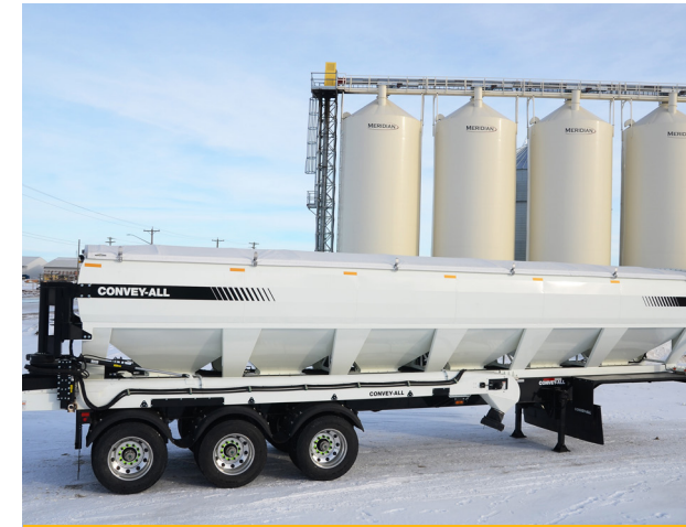
TRI-AXLE AIR RIDE TRAILER

Each compartment features two glasses, one near the top and one at the base.