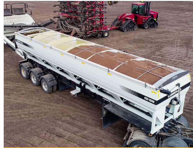
STAINLESS STEEL LINED COMPARTMENTS

In the case of a broken or lost remote, the 1550's Manual Hydraulic Controls are straight forward and easy to use.