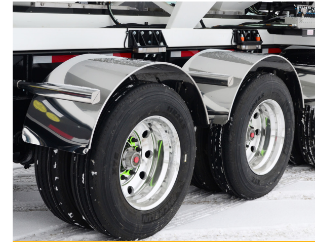
UPGRADED RIM & FENDER PACKAGES

The CST 1550's Air Ride Trailer is heavy duty and made to handle the high demands of your commodities.