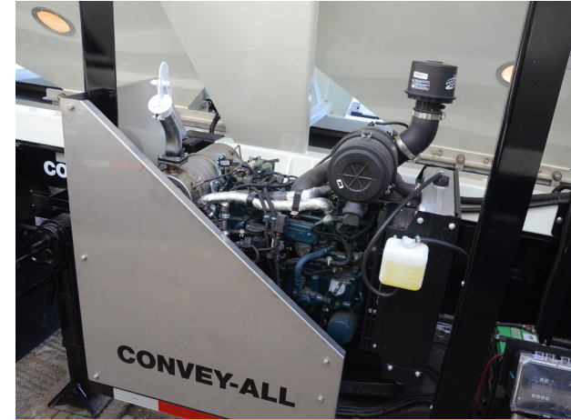
50HP DIESEL ENGINE

High visibility Gate Indicators let you see which gates are in use while operating.