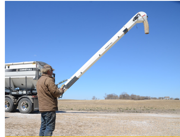
STAINLESS LINED UNLOAD CONVEYOR

Each of the 6 hoppers feature stainless steel slopes and gates, as well as a two stage epoxy/polyurethane coating for durability when hauling fertilizer.